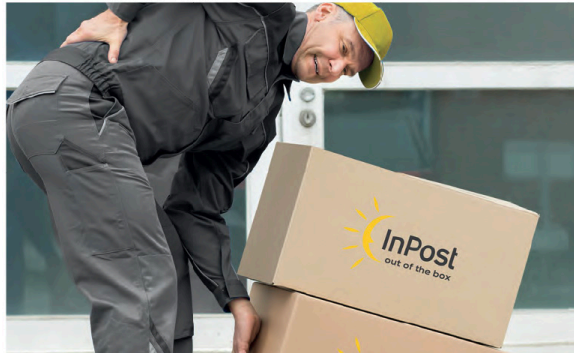
accident at work