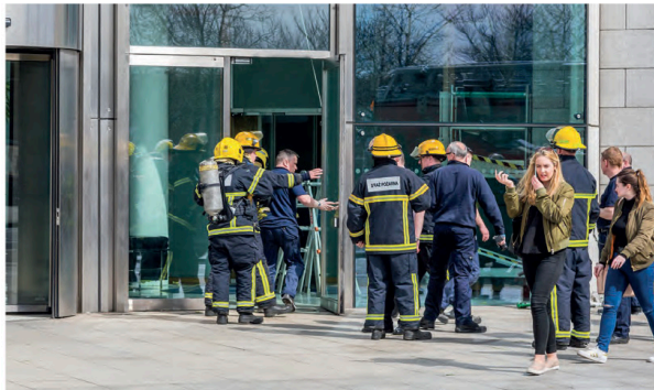
evacuation of the branch