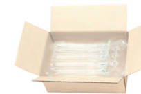
Expanding foam bags