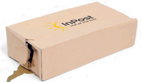
parcel with leaking liquid